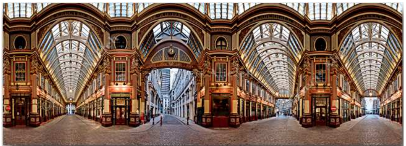
Leadenhall Market - Panorama

The main entrance to the market is on Gracechurch Street. It is open weekdays from 7am until late, and primarily sells fresh food; among the vendors there are cheesemongers, butchers and florists. A number of commercial retailers are also located in the market.